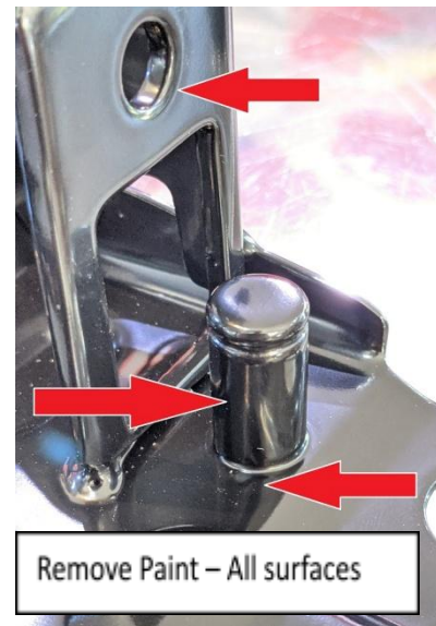
Remove Paint – All surfaces

3 – Take care when fitting the bushes to the solid pin on the shifter base. These are nearly a size-for-size fit. You will need to make sure there is no bur on the Circlip groove, and the base is clean. The bushes may need to be lightly pressed on using an appropriately sized socket or similar.